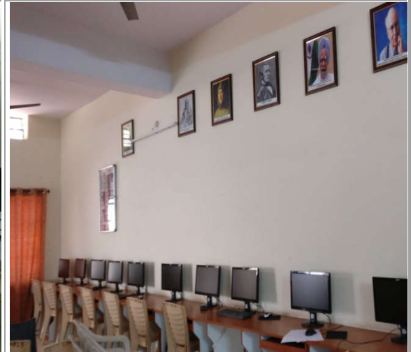
B Com Lab